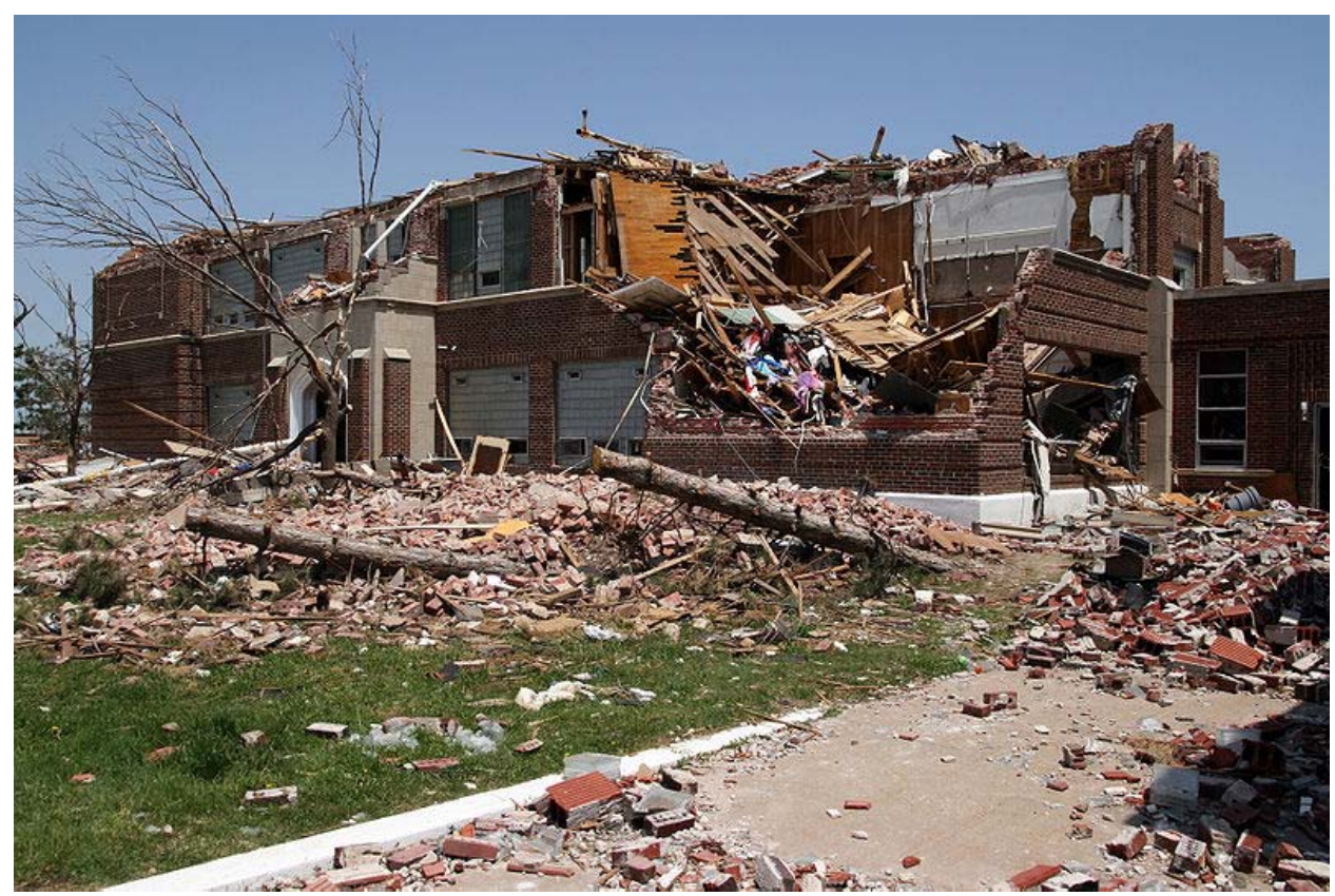
Figure 2: Greensburg High School, Greensburg, Kansas, Fujita 5 tornado, May 4, 2007, at <a href="http://commons.wikimedia.org/wiki/File:FEMA">http://commons.wikimedia.org/wiki/File:FEMA</a> - 30070 - Greensburg High School tornado damage in Kansas.jpg

Tornadoes have a somewhat different mechanism of damage than an explosion, but most intense tornadoes can and have destroyed very substantial buildings, as is clear from Figure 2, which shows a school building destroyed by a "Fujita 5" tornado, which is the most intense level. It is important to note that unlike seismic events, where advanced instrumentation exists to make precise measurements of acceleration and ground motion, severe tornado velocities are a matter of expert estimates rather than precise measurements. One can therefore reasonably expect changes in the science and in the expert estimates in the future. <sup>14</sup> The estimates of the amounts of hydrogen that produced catastrophic damage and the evolving understanding of tornadoes indicate the need for a complete and thorough revaluation of the assumption that Mark I secondary containment buildings are tornado survivable.