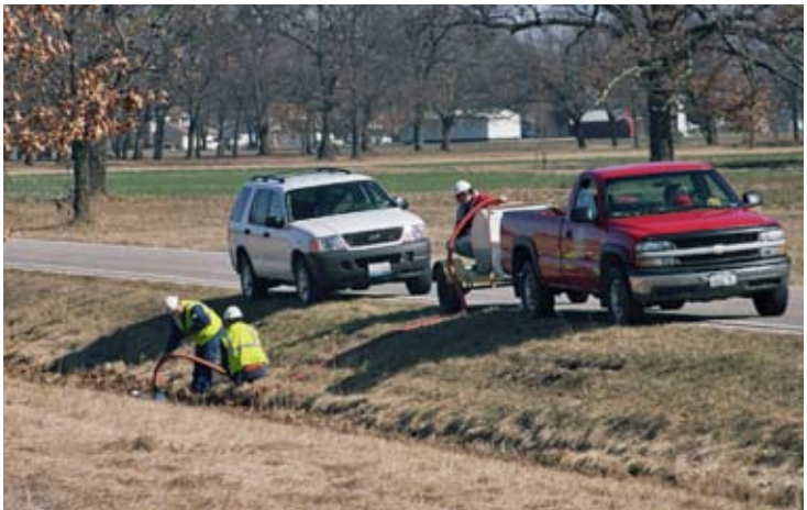
Figure 1. Water contaminated with tritium (up to 1,000 picocuries per liter) was found in ditches running along the west side of Center Street, a public road northeast of the Braidwood Nuclear Power Station, in March 2006. Exelon workers are seen here vacuuming the tritiated water out of the ditches.