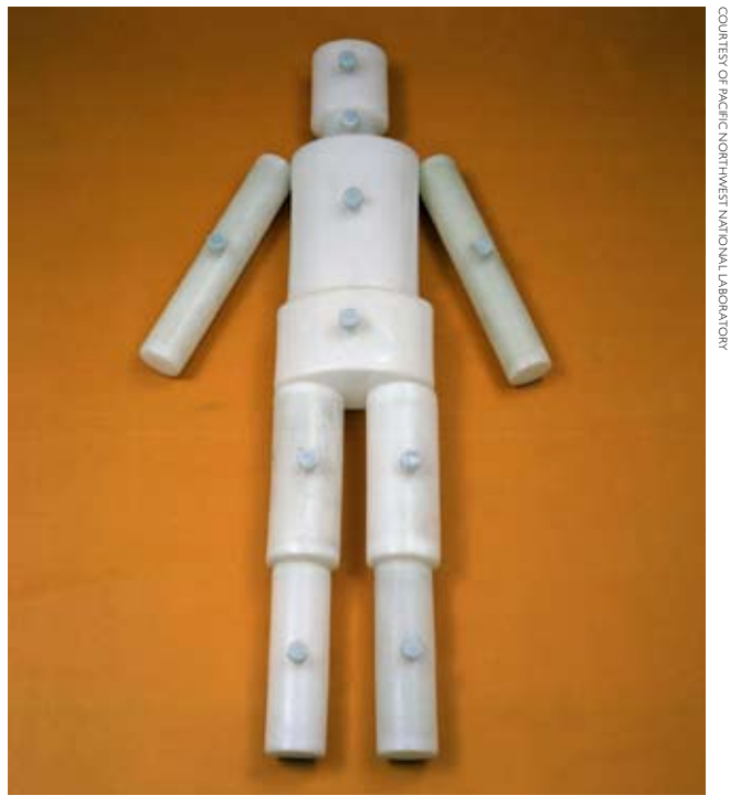
Figure 3: The bottle manikin absorption (BOMAB) phantom simulates Reference Man in size and internal body density. It is used to "calibrate systems used to detect and quantify the amount of radioactive materials in workers." BOMAB is loaned to DOE sites by the Pacific Northwest National Laboratory. Phantoms for a Reference Female and four-year old child are also available.

The continued use of Reference Man does not take into account the greater radiation doses received by some parts of the population that result from the same environmental conditions and the higher cancer risks per unit of dose that they face. This especially applies to women (including pregnant women) and children.