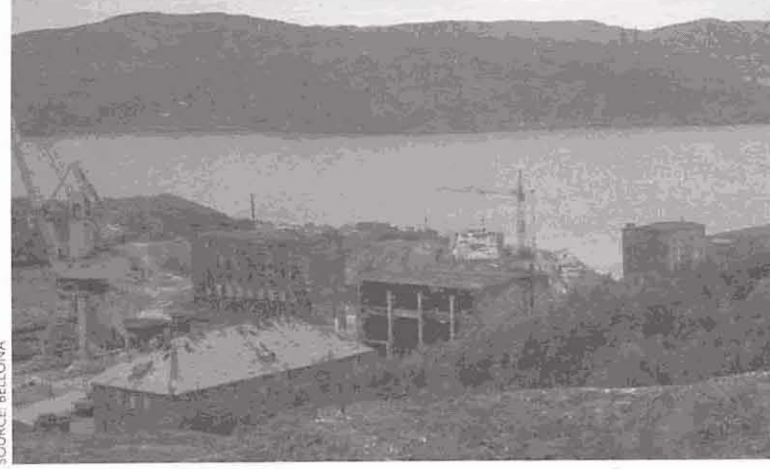
Naval radioactive waste facility at Andreeva Bay in northwestern Russia, the Northern Fleet's largest storage facility for spent nuclear fuel assemblies and solid and liquid radioactive waste.