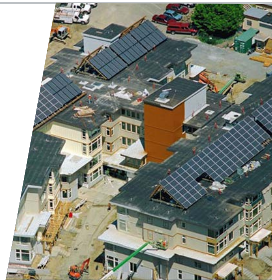
Photo: Lake City Village low-income housing, Seattle, Washington.

The combination of investments in solar energy, efficiency, and weatherization will reduce the amount of assistance needed; in many cases, the bills will be below six percent of income, eliminating the need for assistance. The long-term social cost of a comprehensive program will likely be lower than the present assistance program, even if the number of recipients increases substantially in the future.